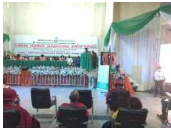
NIAS – ASAN JAM – UYO 2021