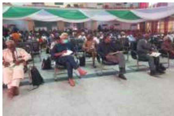
NIAS Council Members