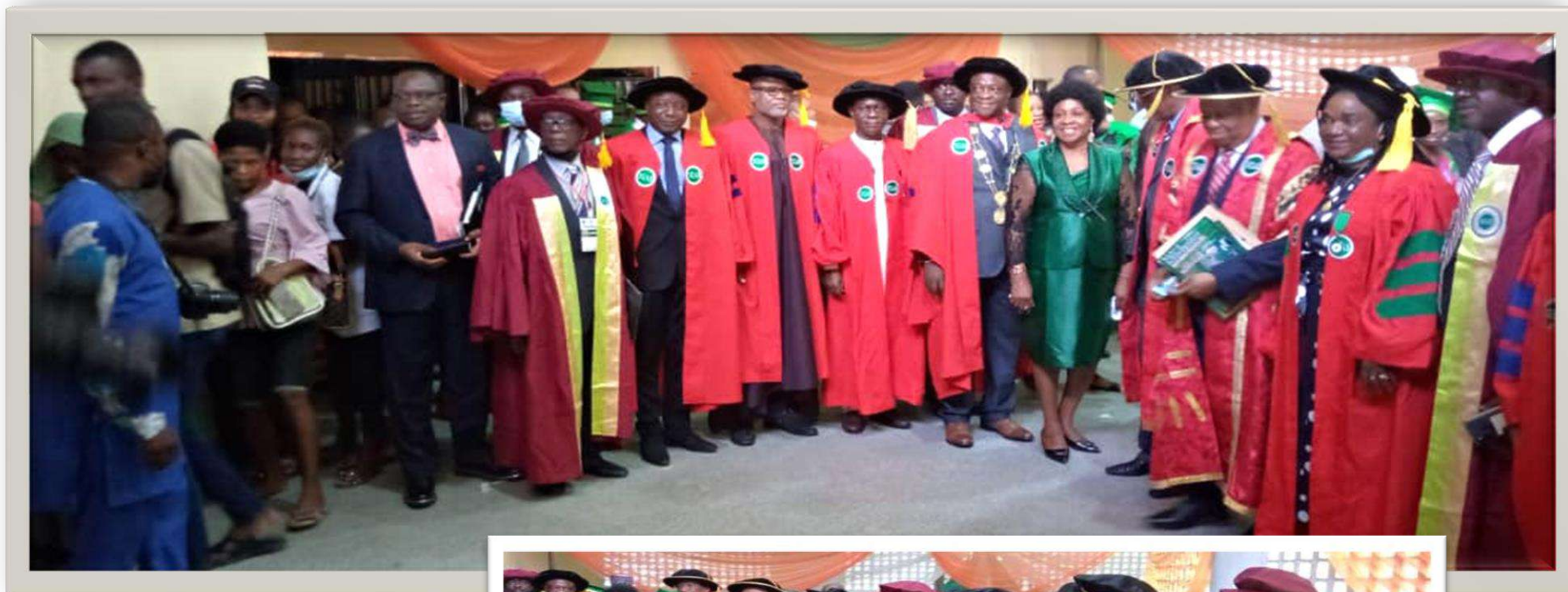
The Council Members of the Nigerian Institute of Animal Science.