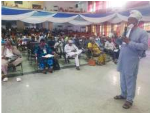
Cross Section of Farmers; Researchers and Industry Experts during the Meeting.