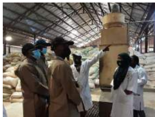
NIAS team with Staff of Biotin Feeds and Concentrates, Kaduna.