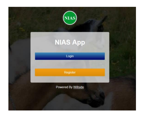
CLICK ON LOGIN