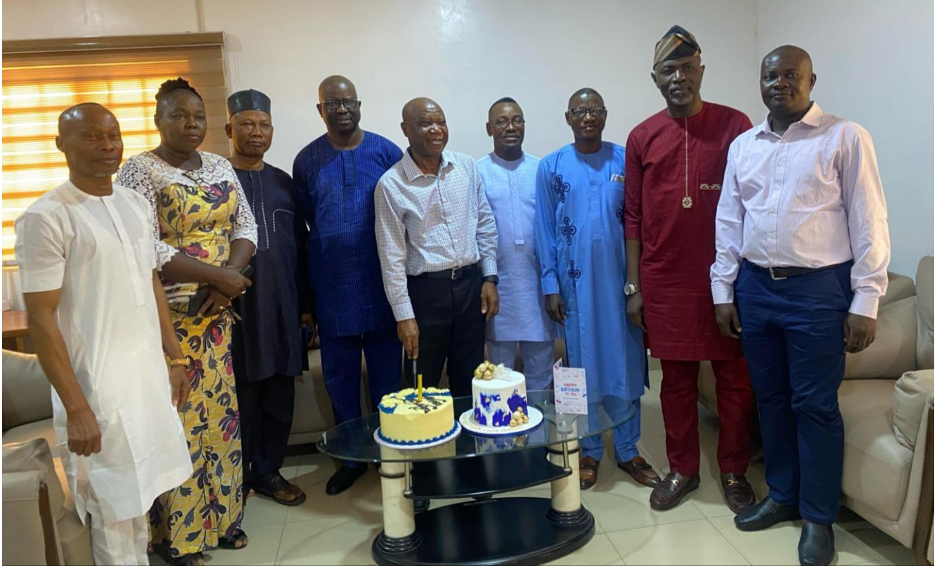
Management and Staff joined the Registrar/CEO NIAS to celebrate his Birthday on April 1 st 2025