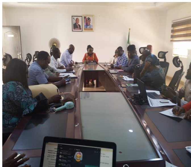
Participants during the meeting.

After the meeting, a compilation of all responses to the questionnaire was made and submitted to the Consultants / BEC-EISMV Representatives.